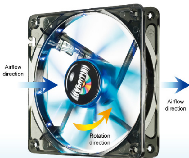
UCTA8/9/12/14 N - BL/R